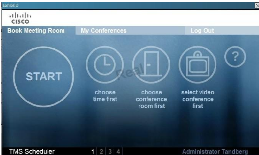
Real 66 Cisco 200-001 Exam